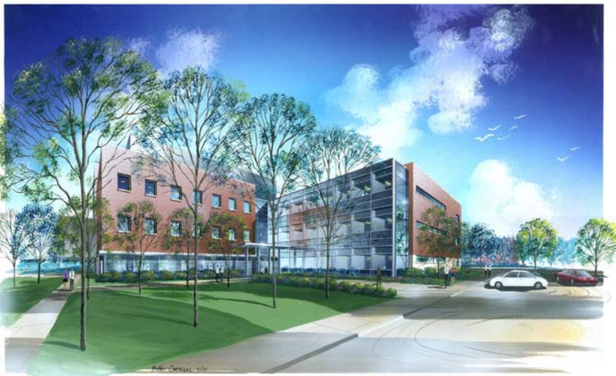
Figure 2. CeMBR's New Home in the Life Sciences Building at Rutgers

CeMBR's organization and network are in place and growing. In March, 2005, CeMBR will move into its new $14 million building on the Rutgers campus in Piscataway, which will provide laboratory, clean room, pilot scale-up and office facilities (Figure 2).